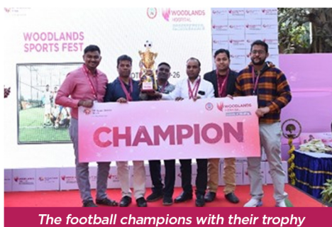
The football champions with their trophy