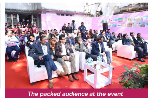
The packed audience at the event