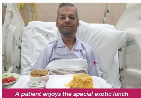
A patient enjoys the special exotic lunch